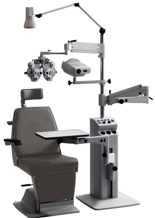
SN-500 combined with Ophthalmic Chair UN-15

* VT-5 View tester, CP-40 Chart projector, UN-15 Ophthalmic chair, U08-04 Projector arm, and U12-05 Slit lamp table top are separately available.