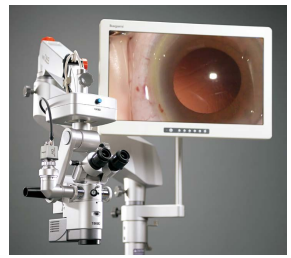
*The monitor screen image is a composite image. Actual image quality may differ from the illustration

* Please contact our Sales Department for further details.