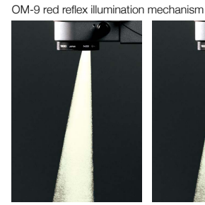
Red Reflex OFF F